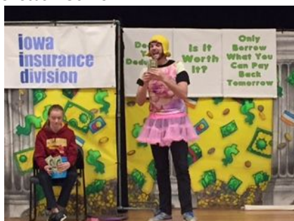
6th grade students participated in an assembly hosted by the Iowa Insurance Division on financial literacy called Penney's for Paychecks